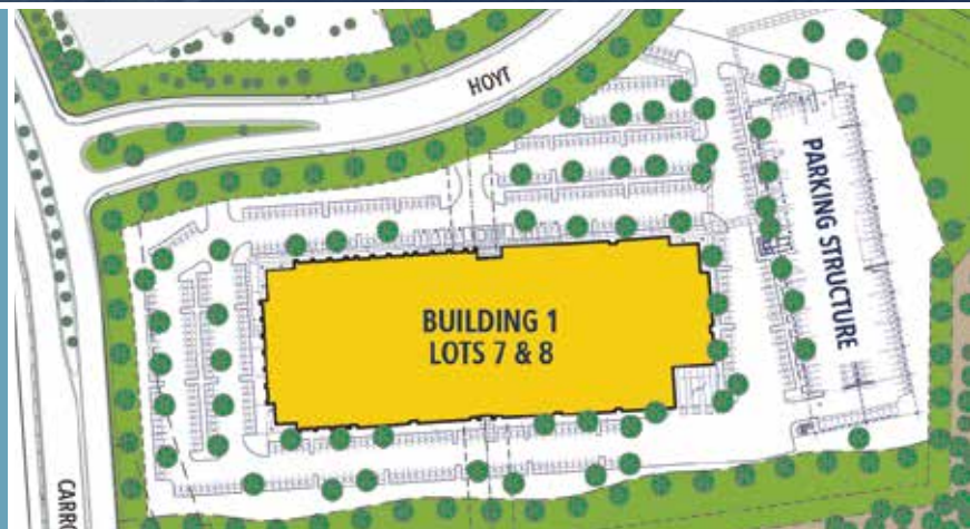
Conceptual Plan ▲